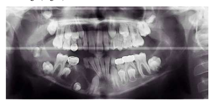
Fig. (1). Clinical Picture of the Lesion.

examination revealed a slight deviation of the face towards right side; a bony hard nodule was seen on the right side below the lower lip without any sign of ulceration and discharge (Fig. 1).