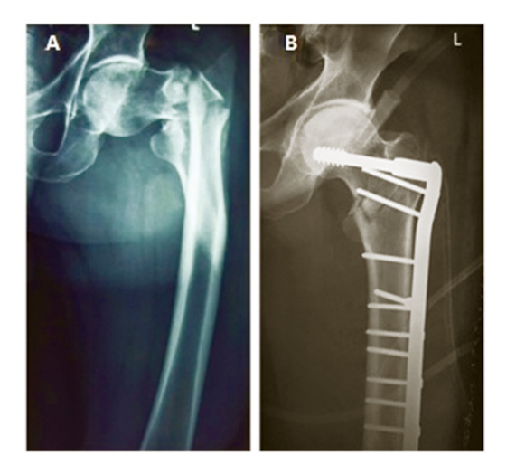
Fig. (3). Pre-op & Post-op x-rays of 49 Years Old Female Patient (A, B).