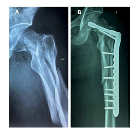
Fig. (4). Pre-op & Post-Op x-rays of 37 Years Male (A, B).